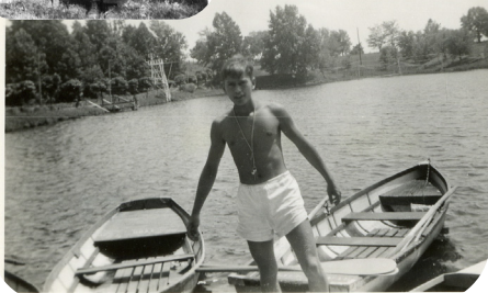
Below: No surprise to see him here at camp's canoe dock.