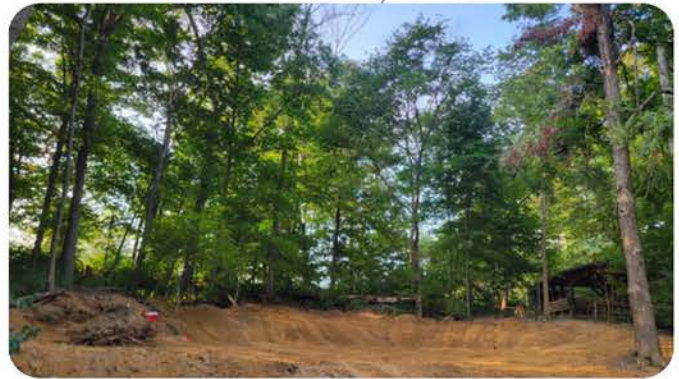
Future home of the new Rifle Range at Camp